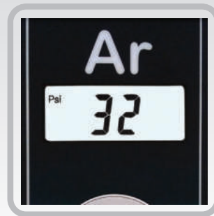
Crystal display with internal illumination