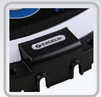
Support with protection for the hoses