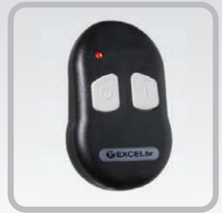
Remote control for free release